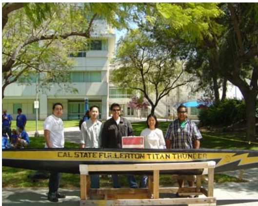
Cal State Fullerton Titan Thunder 2005 Civil Engineers Competition

American Society for Civil Engineers competition hosted by Cal State Fullerton's student chapter of ASCE. The pictures are of event contests such as concrete canoes, steel bridges, and seismic design. Even though this competition is