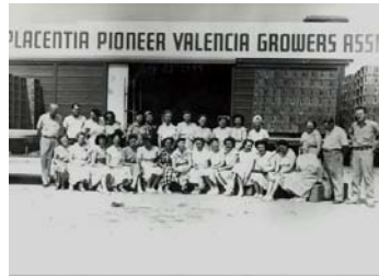
Female workers at a local packing house

This project has also created an online interactive multimedia exhibit site that tells the stories of several ethnically diverse women who resided in Orange County, California from 1870-1970, through their own unique perspectives about their day-to-day lives and the challenges and hardships they faced through a century of the county's agricultural heritage. Collectively their stories will bring to light the many different reasons these women and their families came to Orange County, the difficulties they faced, and the ways in which they endured.