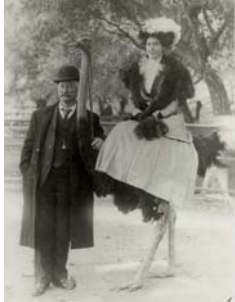
Early Orange County settler at an Ostrich Farm

The California Stories Uncovered exhibit will debut Wednesday, September 20 near the new Orange County Agriculture and Nikkei Heritage Museum. The event will be held between 9:00 a.m. and 11:30 a.m. Attendees are strongly encouraged to bring photos and stories from their personal collections to share and enhance this phenomenal exhibit. (all photos will be scanned for archival purposes and returned)