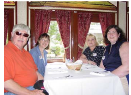
COPH staff enjoying lunch

After a narrated motor coach ride through their vast citrus, avocado, pistachio, and cherry orchards, we headed for Giessinger Winery in Fillmore before climbing aboard the train for a delicious lunch prepared with locally-grown ingredients. After dining, a guest speaker provided a description of his life as a strawberry grower in