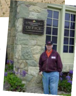
Field Trip Scrapbook