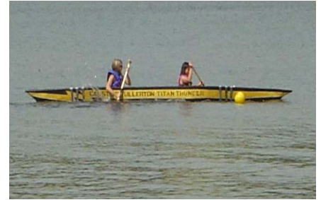
CSUF concrete canoe team in action

To help manage the growing collection of the University's historical documents, the COPH has acquired the PastPerfect Museum Software Program for the digital library. This program provides cataloging capabilities and collection management for archival records and